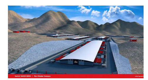
Page 2 of 6

The NNBW reported on 8/7 that UNR unveiled plans to develop a joint computing cluster with Switch to boost research capacity to better support research. Switch and UNR previously collaborated on The Innevation Center, the downtown incubator. Switch is providing $3.4 million in technology infrastructure support services for 5 years housed at Switch TAHOE RENO, The Citadel